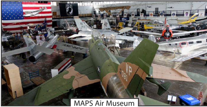
MAPS Air Museum