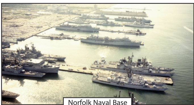
Norfolk Naval Base