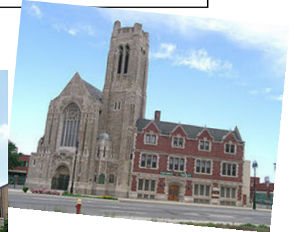
Historic Trinity Lutheran